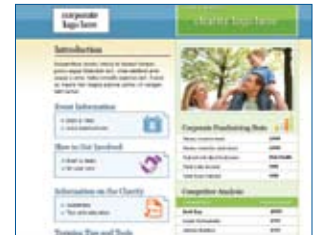
Sample Web Site

To measure the success of the program for you and for your employees, we provide in-depth reports based on specific measurable objectives set forth by you and your team.